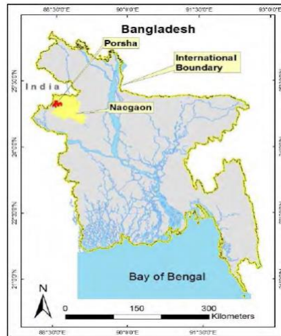
Figure 1: Location of Naogaon District with Respect to Bangladesh

Methods included: Questionnaire surveys; Interviews; Experts' opinion; Key Informant Interviews (KIIs); Focus Group Discussion; and PRA (Participatory Rural Appraisal) techniques.