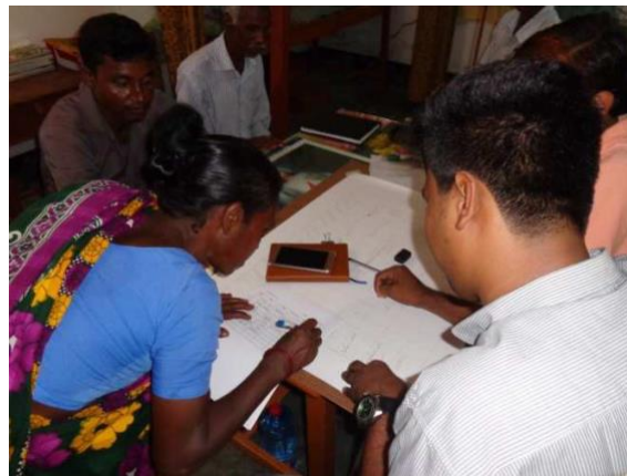
Figure 2: FGD and PRA Work in the Study Area

Methods included: Questionnaire surveys; Interviews; Experts' opinion; Key Informant Interviews (KIIs); Focus Group Discussion; and PRA (Participatory Rural Appraisal) techniques.